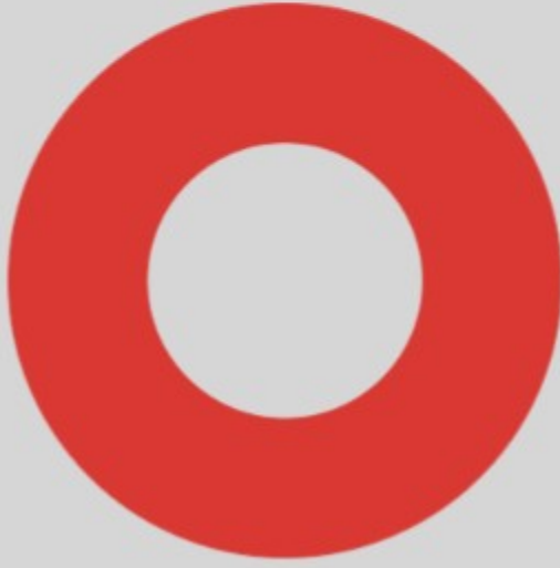
Current Fund Allocation Ratio

Mutual Funds Participation Shares 100.00%