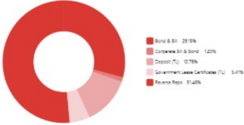
Current Fund Allocation Ratio