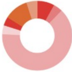
Current Fund Allocation Ratio